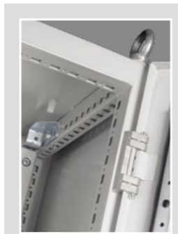
五折结构框架 5-fold structural frame