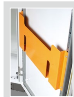
加强方管与A3资料盒 Reinforcing square tube and A3 document box