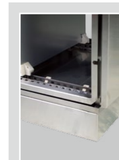
固定底座 Fixing base