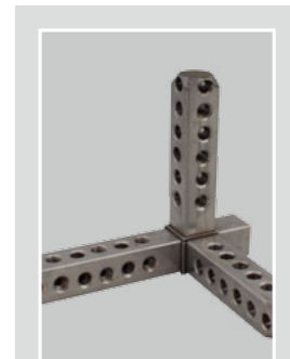
不锈钢三通连接件 Stainless steel three-way connection element