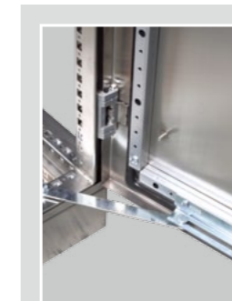
限位器/铰链/加强方管 Stopper/hinge/ reinforced square pipe